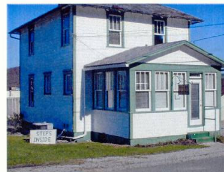
Help keep the Steps Open

In May of 2003 we were able to secure a mortgage with Community Bank to purchase this property. Your financial support is greatly needed to help us fulfill our obligations. Each contribution or donation is fully tax deductible.